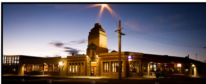
Central Hotel Motel, Lakes Entrance. Ph 5155 1977 info@centralhotel.com.au