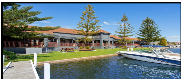
Mariners Cove Motel, Paynesville. Ph 5156 7444 reception@marinerscoveresort.com