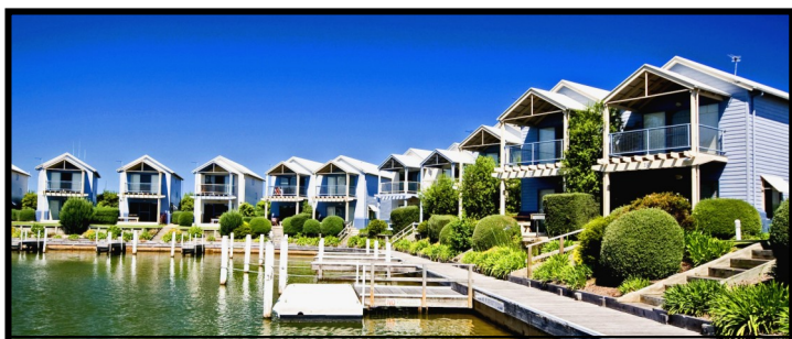
Captains Cove Waterfront Ap'ments Paynesville. Ph 5156 7223 Info@captainscove.com.au

ENTRIES CLOSE: MONDAY 4TH NOVEMBER 2024 OR WHEN FIELDS ARE FULL CAPACITY